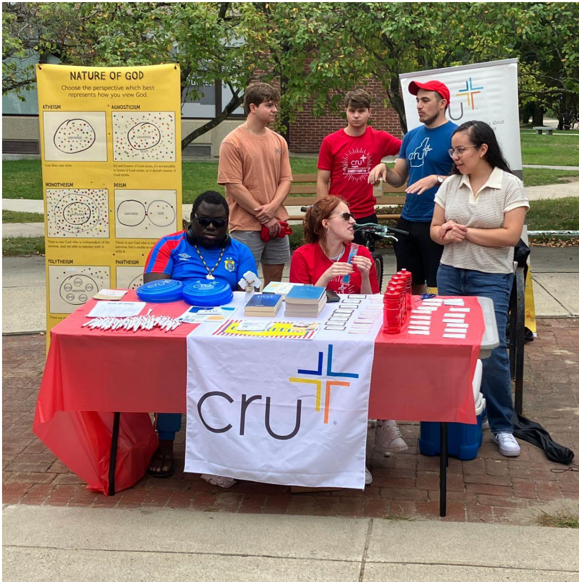
Ready to Table: One of my teammates with Keene Cru students