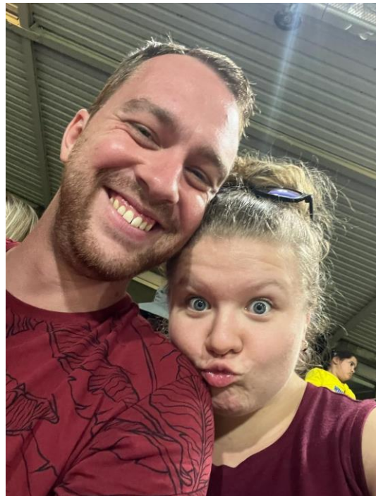
The two goof balls together!