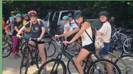
Charlestown VBS - Putting on the Armor of God (Left)